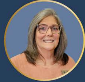
Catherine Bell Place 6