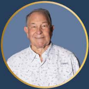
Ron Munos Mayor