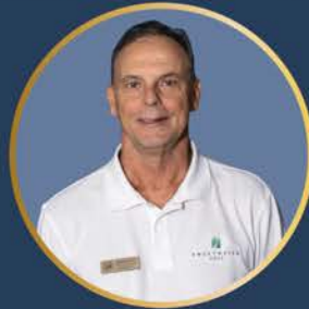
Michael Berg Place 5