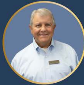
Brian Edwards Place 1